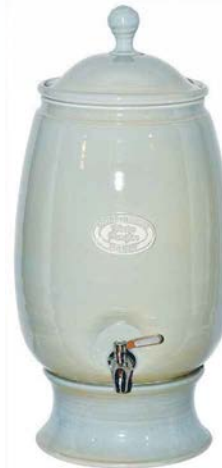
duck egg blue