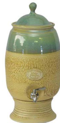
sage green & ash