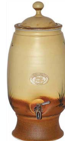
stick grass sand