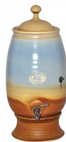
windmill light blue