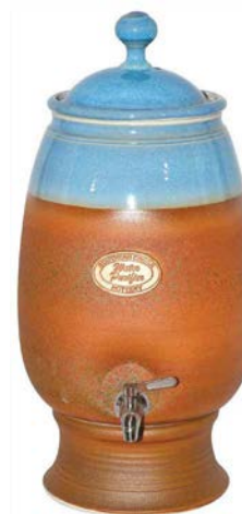
starry blue & matte brown