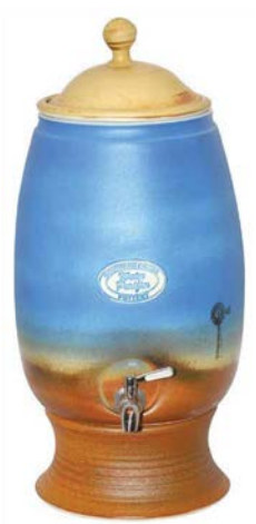
windmill dark blue