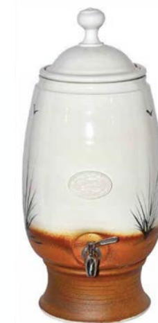
stick grass cream