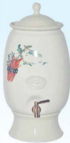
desert sturt pea