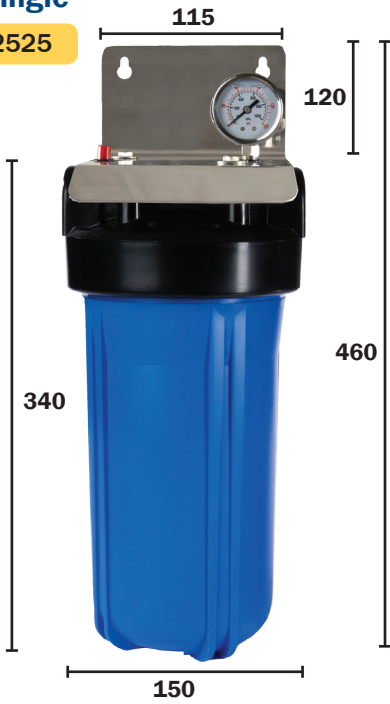
150mm W x 460mm H x 205mm D