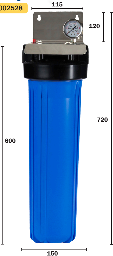
150mm W x 720mm H x 205mm D