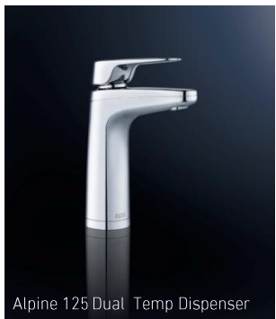
Alpine 125 Dual Temp Dispenser