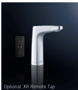
Optional XR Remote Tap