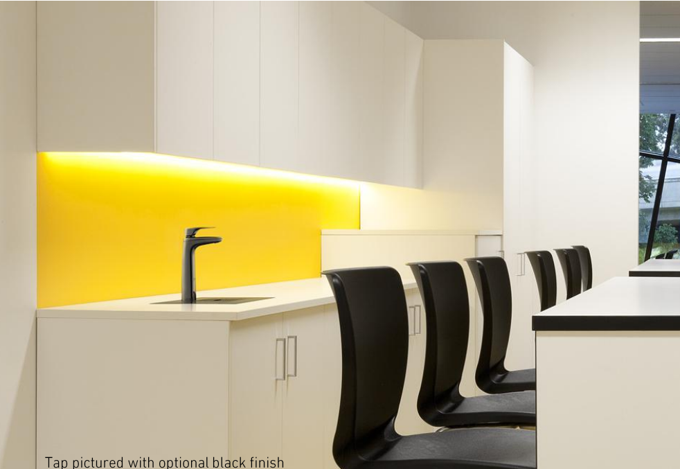
Tap pictured with optional black finish

“As an option to the boiling and chilled systems, the Sahara dispenses boiling and unlimited ambient filtered water at the touch of a lever.”