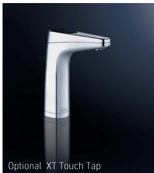
Optional XT Touch Tap

Billi now offering a choice of 4 tap styles.