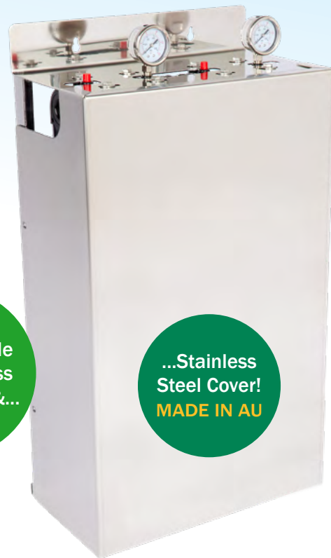
Item No. 4388 Cover Only