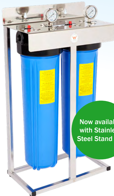
Item No. 4555 Complete Twin System with Stand