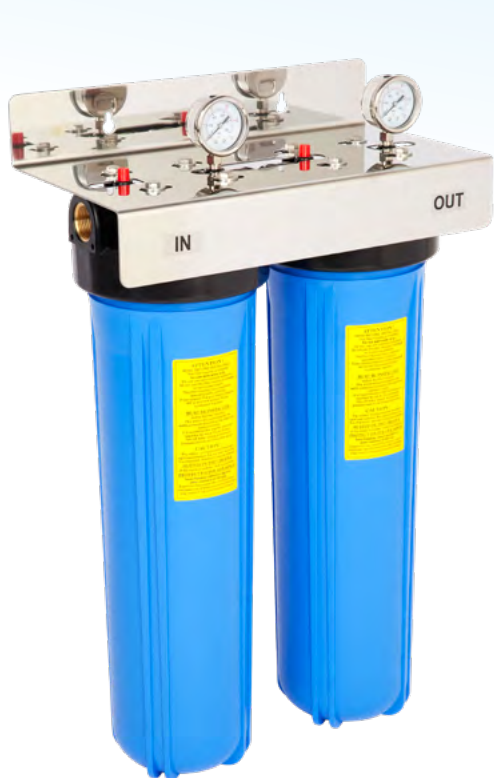
Item No. 4020 Complete Twin System

Caleffi Pressure Reducing Valves Made in Italy